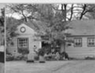
8624 Redondo Dr