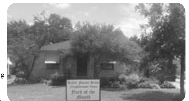
June Yard of the Month 8914 San Fernando Way