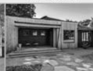
8635 Diceman Dr