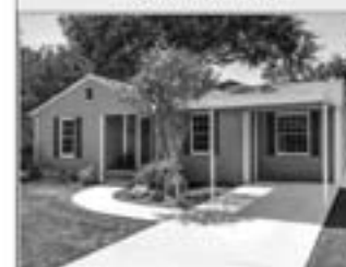
8919 San Fernando Way