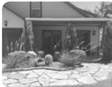
May Yard of the Month

Little Forest Hills Neighborhood Association participates in a Yard of the Month Program. Walton's Garden Center sponsors the yard each month and provides the owners with a gift card to be used at their garden center.