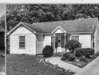
8707 Santa Clara Dr