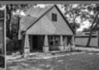
9010 Eustis Ave