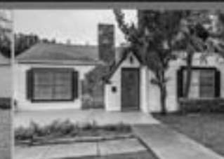
8618 San Benito Way