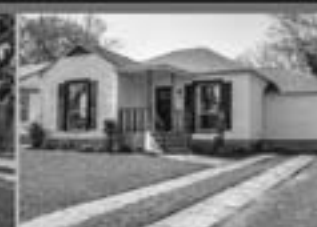
8811 Santa Clara Dr